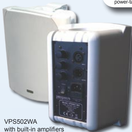
VPS502WA with built-in amplifiers